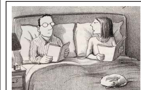
Could you stop making that breathing sound?

A man walked into a religious gift shop and a display of caps with WWJD on them. He asked the clerk what they meant and she said “What Would Jesus Do?” The man thought a moment before replying, “Well, I don’t think Jesus would pay $17.95 for one of these caps.”